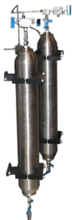
3 Phases Separator